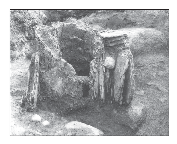
Fig. 6. Excavated furnace from the Late Iron Age at Dokfløy.