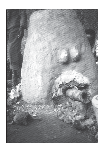
Fig. 4. Furnace with breast and vulva penetrated.

"The concepts of "fertility" and "sex" involved in smelting are also evident in the speech and actions of the miners. No one is allowed to watch when the smelter is placing the tuyeres into the furnace. The smelter while doing so has to be totally naked in front of the furnace. This is another example, which illustrates the representation of the furnace as the smelter's wife – his nakedness illustrating the intimacy between the husband and wife. The tuyeres, which have phallic appearances, are known as "tora", which is just a slight modification of the Nepali term for male genitalia, which is "turi". The pumping of the bellows is regarded