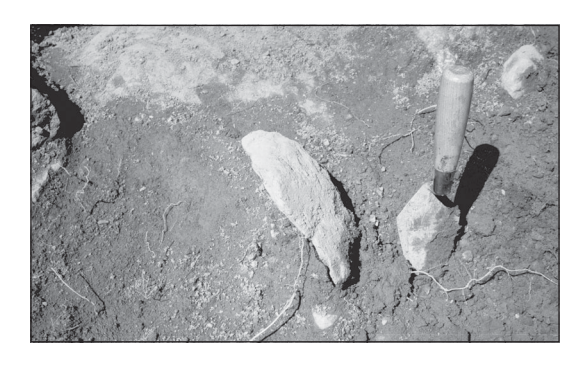
Fig. 8. Excavation of a mound at Vårby 2003. The stone is recorded standing within a layer and indicate that the deposition of earth has gone fast. The archaeological experience must be discussed and developed as archaeology, and not only through other disciplines as part of "non-destructive" prospecting methods. We need to develop both, and not let technique become the great archaeological sleeping pillow.

Earth could also unite or create family-like relations. In 'Gisli's Surssons saga', Torgrim, Gisle, Torkjell and Vestein mix blood and earth and crawl under turf in a ritual ceremony, which made them brothers ('Gisli's Surssons saga' chapter 6). It is obvious that earth as an element was connected to cosmology and rituals. In excavation reports there are sometimes revised close relations between furnaces and graves since graves are documented inside furnaces (Appelgren & Broberg 1998:34-35). Birth and rebirth, death and fertility are discussed in anthropological literature and show us that perspectives on these subjects are closely interlinked in their way of thinking (Bloch & Parry 1989). The relation between iron and earth is noted in literature (Burström 1990), but seldom treated in a symbolic perspective (Hjärtner-Holdar 1993; Englund 2002).