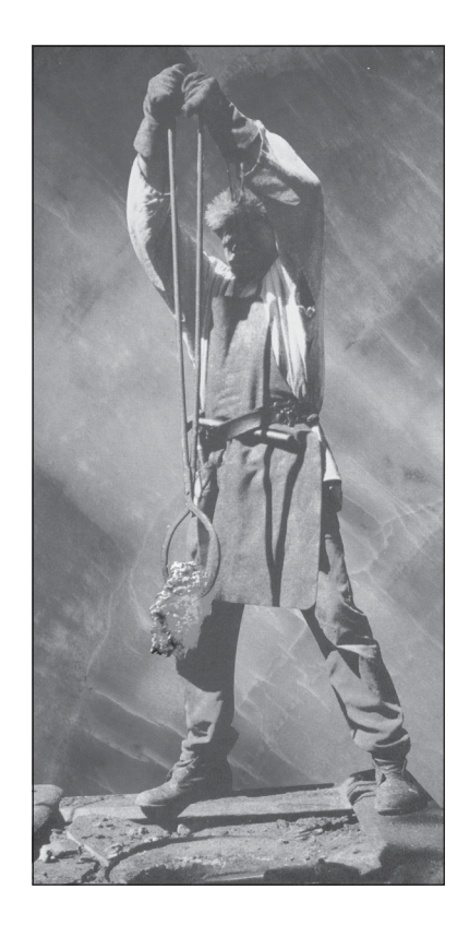
Fig. 7. The birth of iron at Borre (Photo: Riverud, designed by Løwe design).

We must view them [dwarfs] as the mythical representatives of a profession, paralleling the craftmensmiths of early society, who were, indeed, endowed with ritual importance (Motz 1993:84).