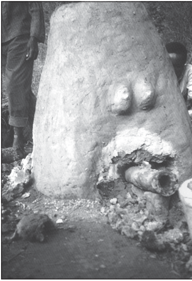
Fig. 4. Furnace with breast and vulva penetrated.

"The concepts of "fertility" and "sex" involved in smelting are also evident in the speech and actions of the miners. No one is allowed to watch when the smelter is placing the tuyeres into the furnace. The smelter while doing so has to be totally naked in front of the furnace. This is another example, which illustrates the representation of the furnace as the smelter's wife – his nakedness illustrating the intimacy between the husband and wife. The tuyeres, which have phallic appearances, are known as "tora", which is just a slight modification of the Nepali term for male genitalia, which is "turi". The pumping of the bellows is regarded as the "heavy breathing during sexual intercourse". Among the Agaria of India, there is a saying that "the woman gives birth and the man cares for it", which means the iron that was born in the furnace must be refined in the forge" (Rijal 1998:73).