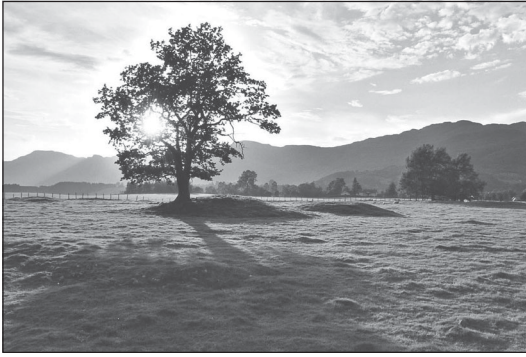
Fig. 1. Mounds in Etne, western Norway.

the same (Burström 1993, 1996). This brings us to a key point in pre-Christian culture in Scandinavia, namely, the meaning and honour connected to memory. Visibility, monumentality and exposure are connected to collective references. Mounds maintain histories and re-