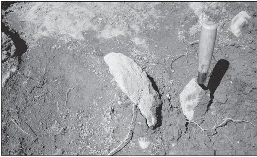
Fig. 8. Excavation of a mound at Vårby 2003. The stone is recorded standing within a layer and indicate that the deposition of earth has gone fast. The archaeological experience must be discussed and developed as archaeology, and not only through other disciplines as part of "non-destructive" prospecting methods. We need to develop both, and not let technique become the great archaeological sleeping pillow.

Earth could also unite or create family-like relations. In 'Gisli's Surssons saga', Torgrim, Gisli, Torkjell and Vestein mix blood and earth and crawl under turf in a ritual ceremony, which made them brothers ('Gisli's Surssons saga' chapter 6). It is obvious that earth as an element was connected to cosmology and rituals. In excavation reports there are sometimes revised close relations between furnaces and graves since graves are documented inside furnaces (Appelgren & Broberg 1998:34-35). Birth and rebirth, death and fertility are discussed in anthropological literature and show us that perspectives on these subjects are closely interlinked in their way of thinking (Bloch & Parry 1989). The relation between iron and earth is noted in literature (Burström 1990), but seldom treated in a symbolic perspective (Hjærtner-Holdar 1993; Englund 2002).