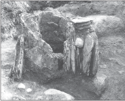
Fig. 6. Excavated furnace from the Late Iron Age at Dokfløy.