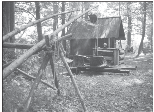
Fig. 5. Furnace at Borre with bellows (Photo: Gansum).

A consequence of the birth of iron may lead us to treat the artefacts as having social qualities and names, which indeed they have. The mythology is probably telling about the birth of iron.