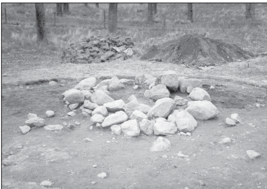
Fig. 2. Excavation of a mound at Vårby 2003. Turf and earth are moved into a new context as heaps.

The interfaces that have been exposed for a long time period will be keys to understanding the mound constructions as well (Krogh 1993:98, 222; Holst et al 2001). The stratigraphy recorded in a matrix gives other possibilities to tell more complex stories, also with